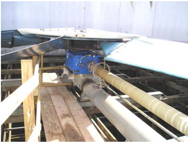
Cooling Tower Shaft Driven Gear Box

Cooling towers offer the vibration analyst many challenges in sensor selection, mounting and environmental conditions. The motor is typically out in the open and very easy to access, but almost always the gear box is the failure point. Unfortunately for the analyst, the gear box is normally located above an environmentally hazardous soup bowl and just slightly below a rotational guillotine. Is it any wonder that the motors rarely fail? Technology and safety can prevail with the installation of permanent vibration sensors. This improves the life and reliability of the cooling tower and the vibration analyst!