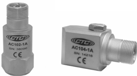
AC102-1A & AC104-1A sensors

General purpose sensor types AC102 (top exit) or AC104 (side exit) could be used for measuring vibration frequencies greater than 30 CPM (0.5 Hz). Special purpose low frequency sensor types AC135 (top exit) and AC136 (side exit) could be used to measure vibration frequencies greater than 12 CPM (0.2 Hz).