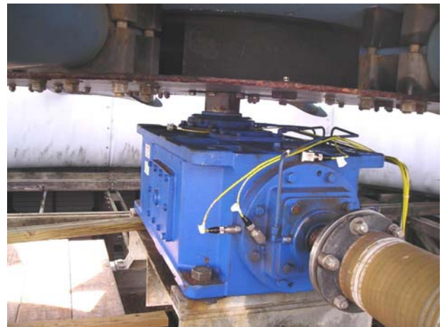
Radial & Axial Sensors on Gear Box Input Bearing Housing

Accelerometers are typically placed at key locations on the motor and gear box. Since the gearbox is the load bearing part of the mechanical drive train, accelerometers should be placed on the input and output bearing housings to measure the vibration levels.