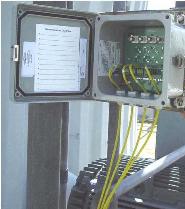
MX102-4C MAXX Box with 4 Channels Mounted Outside Cooling Tower

Having rugged secure connections to the sensor is a necessity. These same thoughts should also be applied to the data collection end of the cables. There are several options available to keep the interface between the sensor cables and data collection dry, clean, and organized. Portable data collection can be easily completed by interfacing with a MAXX Box or with a Switch Box. Both of these options provide convenient connections for the data collector cable. In permanent monitoring, a Switch Box or a Signal management Box can be used. No matter which method is chosen, it will prevent wiring spaghetti and organize your data collection points.