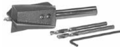
Spot Face, Drill & then Tap for Stud Mounting